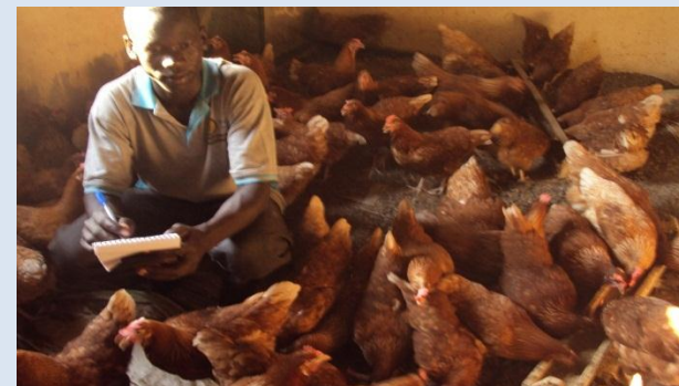
Our Livelihood interventions provide socio-economic security & fights hidden hunger