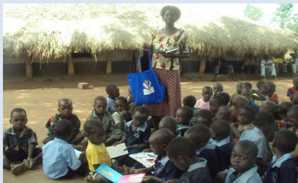
Volunteer teacher at ECDC gives out kits from HHI to children

Global giving Peace and reconciliation Ministries in Africa. Children Chance International (CCI) Lira and Kole District local Governments. Hands to Hearts International