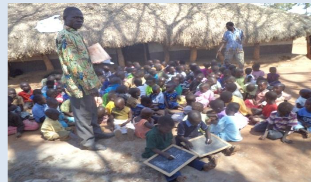
Community based approach to Early Childhood Development

The Odwar Fund P.O.BOX 70363, Kampala – Uganda. Located at Plot 44, Kole Road, Adyel Division-Lira Municipality Tel: +256392613777/+256782783363 Web: www.theodwarfund.org Email: info@theodwarfund.org