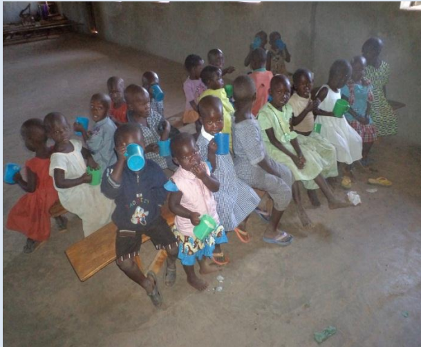
Children enjoy Nutritious porridge at an early childhood development center